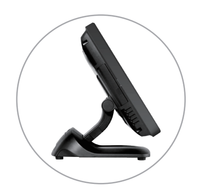
Full Extended Mode

The XT-4015 provides the selection of two foldable bases, the curvy slim GEN7E base and the larger but practical GEN8E base. The foldable base can be configured into "Flat Folded Mode" to save the shipping package volume, "Low Profile Mode" to allow greater interaction between the cashier and the customer, and the traditional "Full Extended Mode". All this can be achieved with a simple pull of the hidden lever.