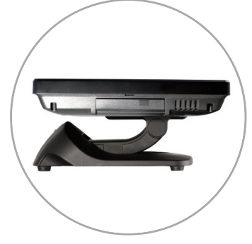
Flat Folded Mode