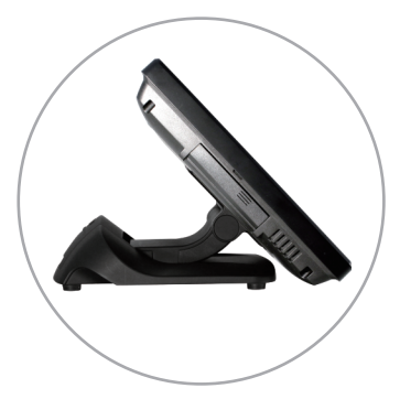
Low Profile Mode